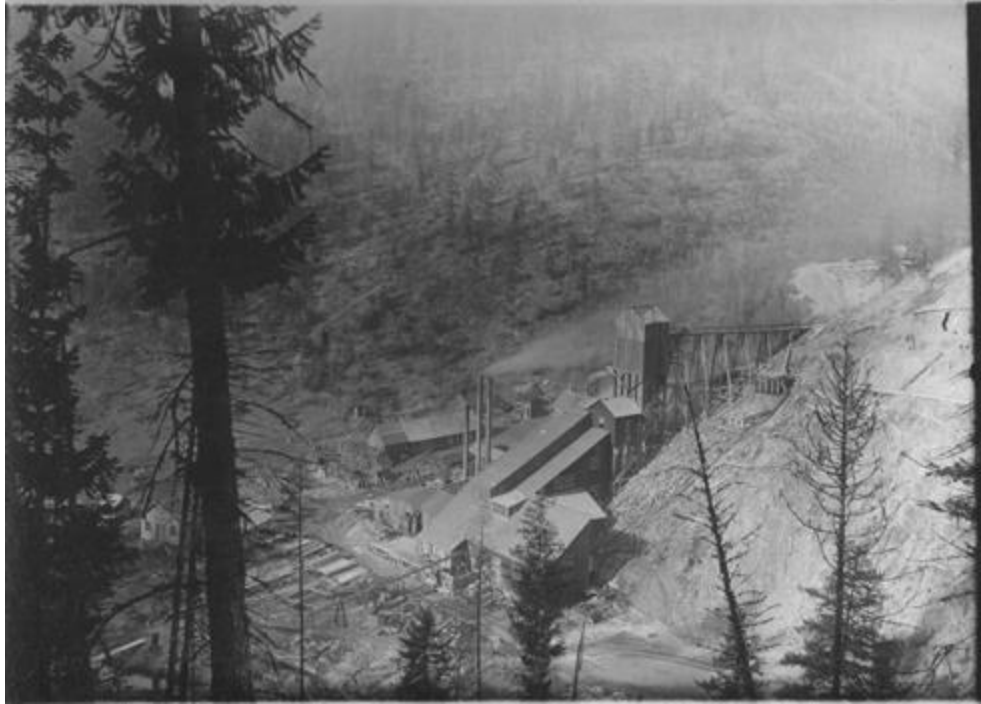
Iron Mountain Mine concentrator located about a mile downstream of Iron Mountain Mine at Pardee 1898